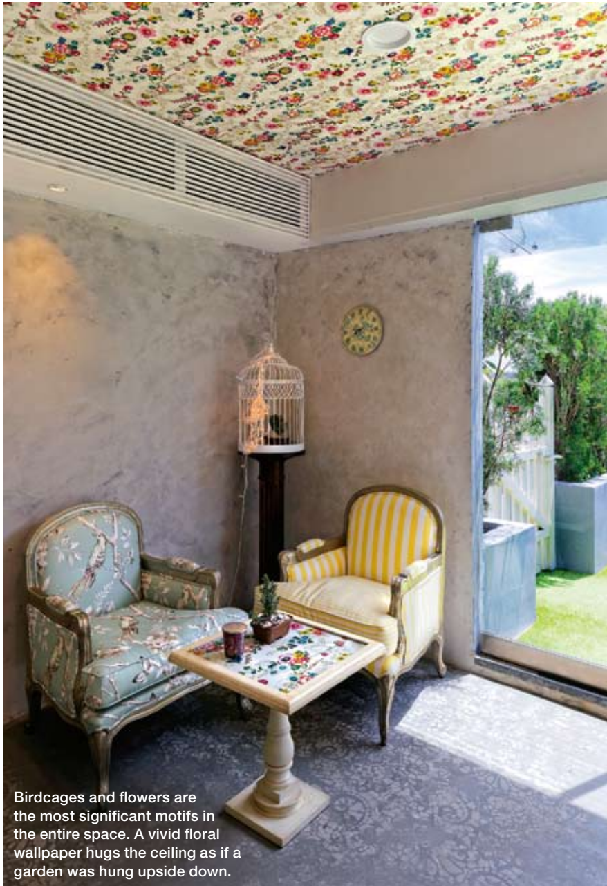
Birdcages and flowers are the most significant motifs in the entire space. A vivid floral wallpaper hugs the ceiling as if a garden was hung upside down.