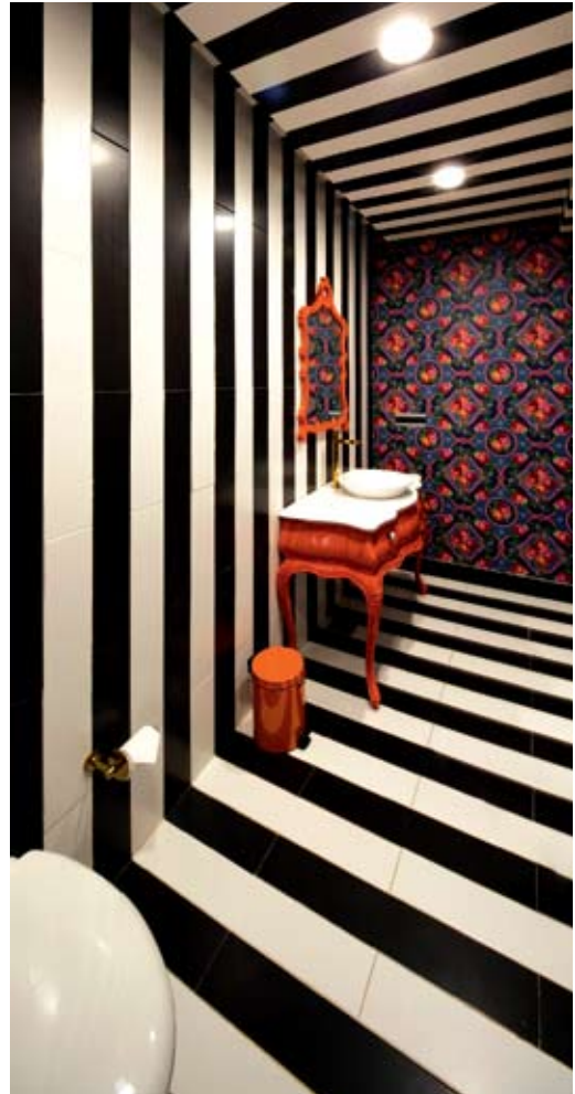
A black and white striped shell, a bright cross-stitched wallpaper on the adjacent wall along with a vermillion vanity adorn the bathroom.