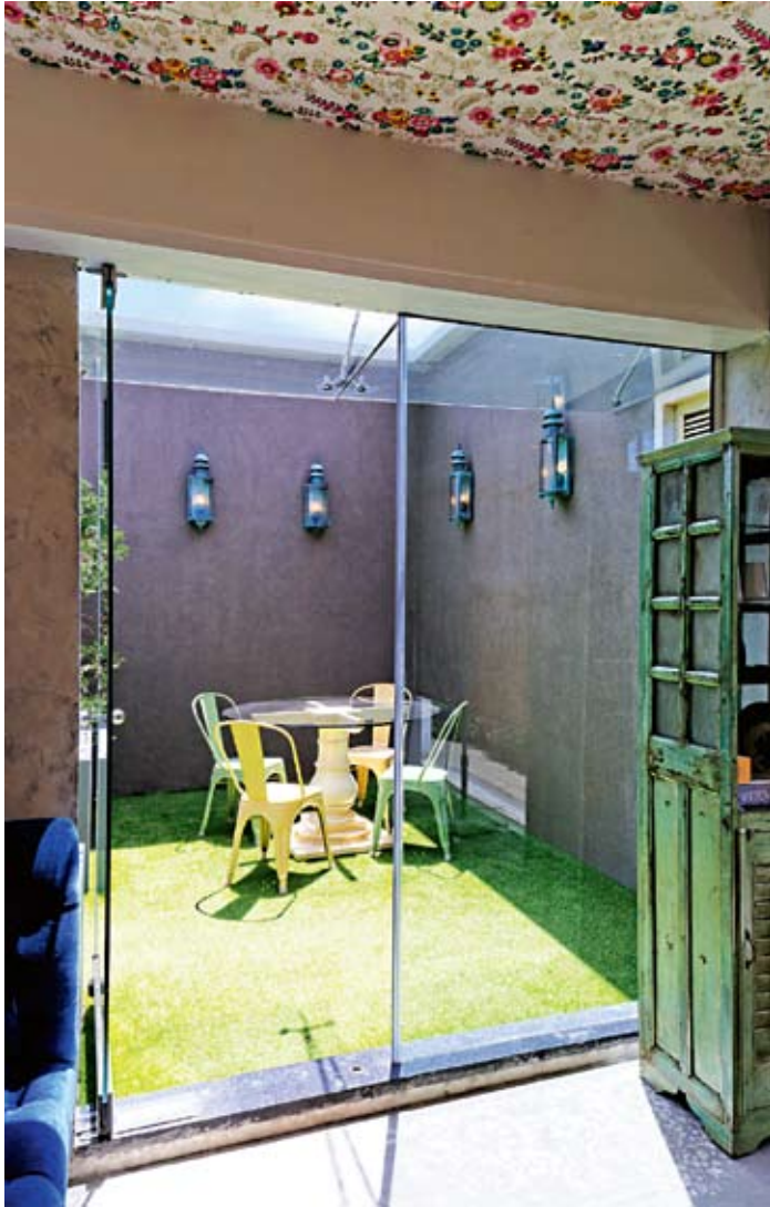
The outdoor space has a discussion area and a garden which can also double-up as a lunch table.

the 'La Vie' logo. The reception area has an unadorned cream distressed desk and is separated from the rest of the space by a vintage screen with bird imagery.