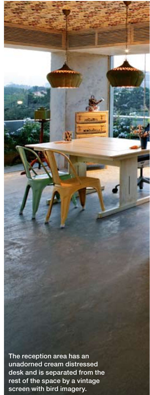
The reception area has an unadorned cream distressed desk and is separated from the rest of the space by a vintage screen with bird imagery.

recreated for them in their office space with an abundance of pastels and floral touches.