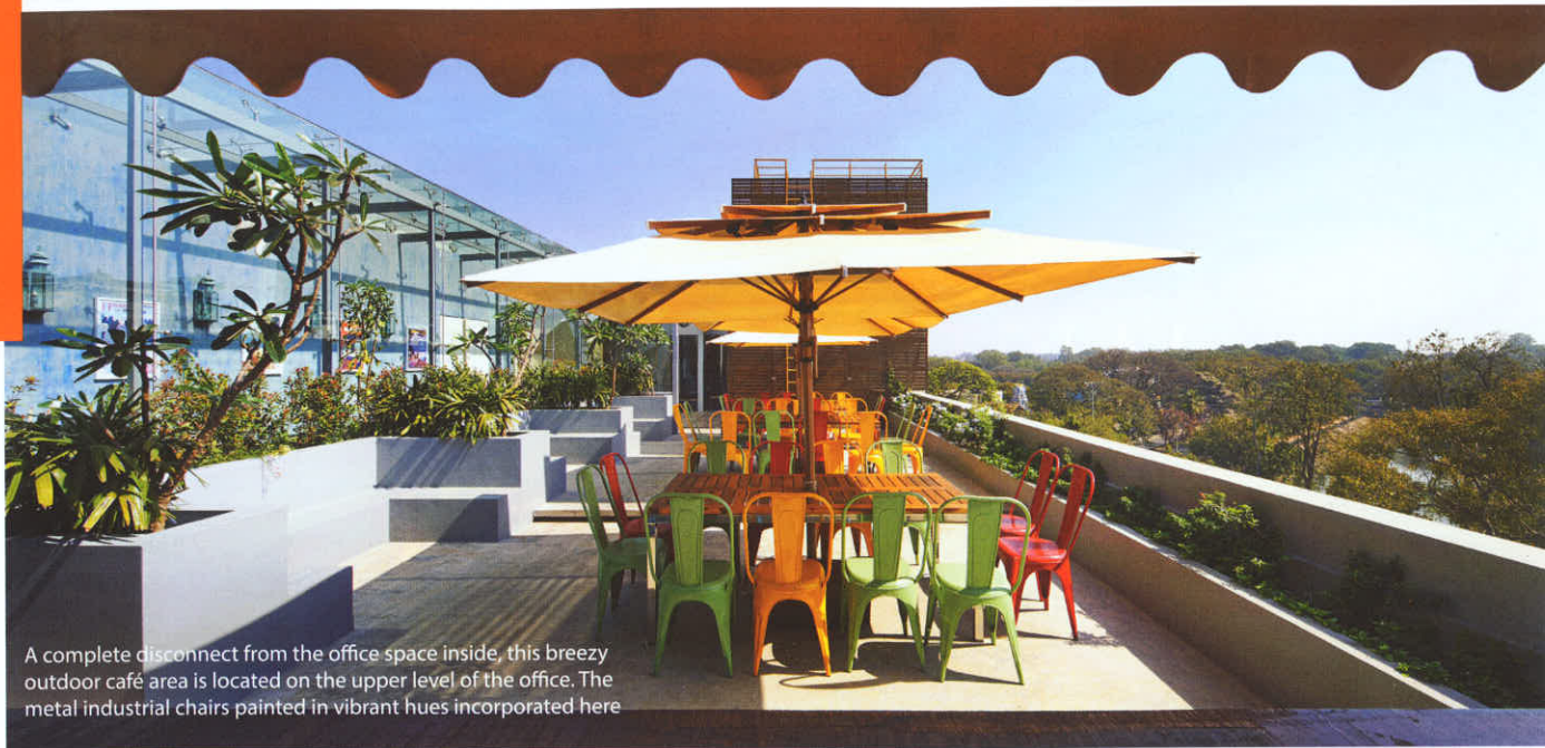
A complete disconnect from the office space inside, this breezy outdoor café area is located on the upper level of the office. The metal industrial chairs painted in vibrant hues incorporated here