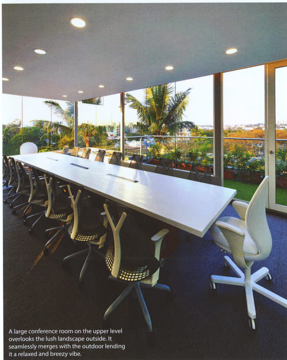
A large conference room on the upper level overlooks the lush landscape outside. It seamlessly merges with the outdoor lending it a relaxed and breezy vibe.

The glazing and aluminium façade cladding experts, Alufit, roped in FADD Studio to design their 12,000 sq ft office space, spread across two levels at Meanee Ave Road, Bangalore. The company's primary requirement was that of a clean-lined, free flowing space that maximises natural light. "The client wanted a simple and crisp design that's open to interpretation," says Farah Ahmed, Principal Designer, FADD Studio.