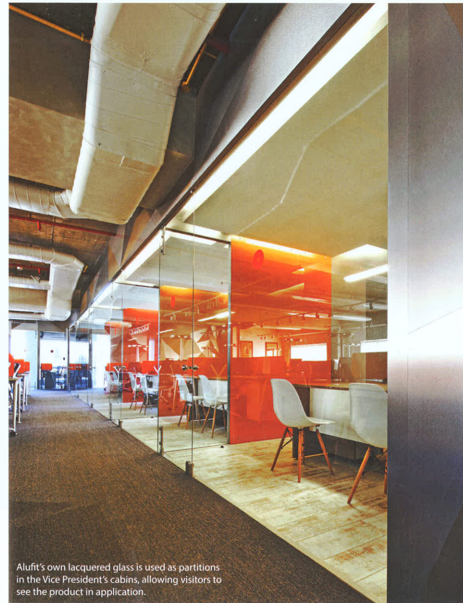
Alufit's own lacquered glass is used as partitions in the Vice President's cabins, allowing visitors to see the product in application.