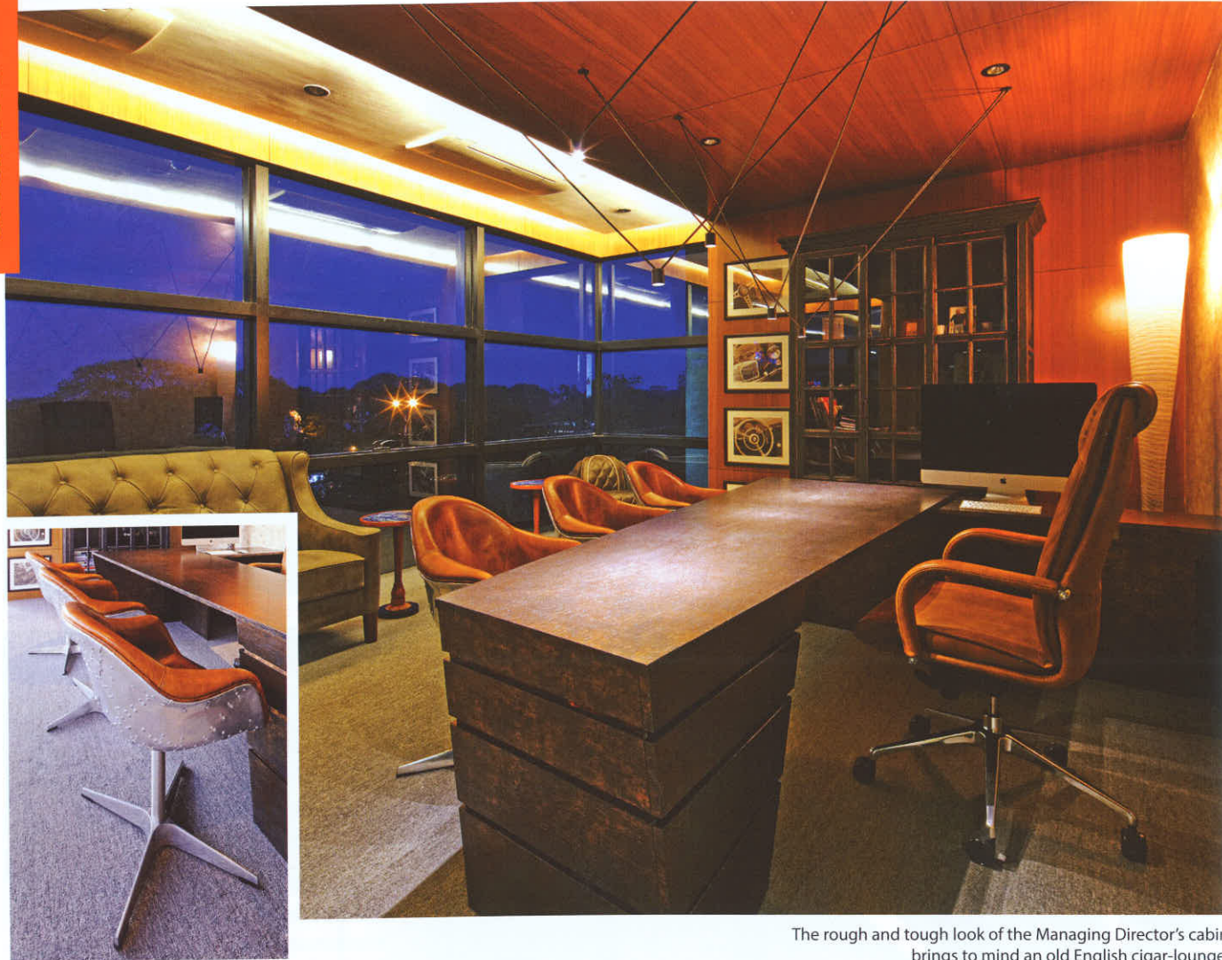
The rough and tough look of the Managing Director's cabin brings to mind an old English cigar-lounge.