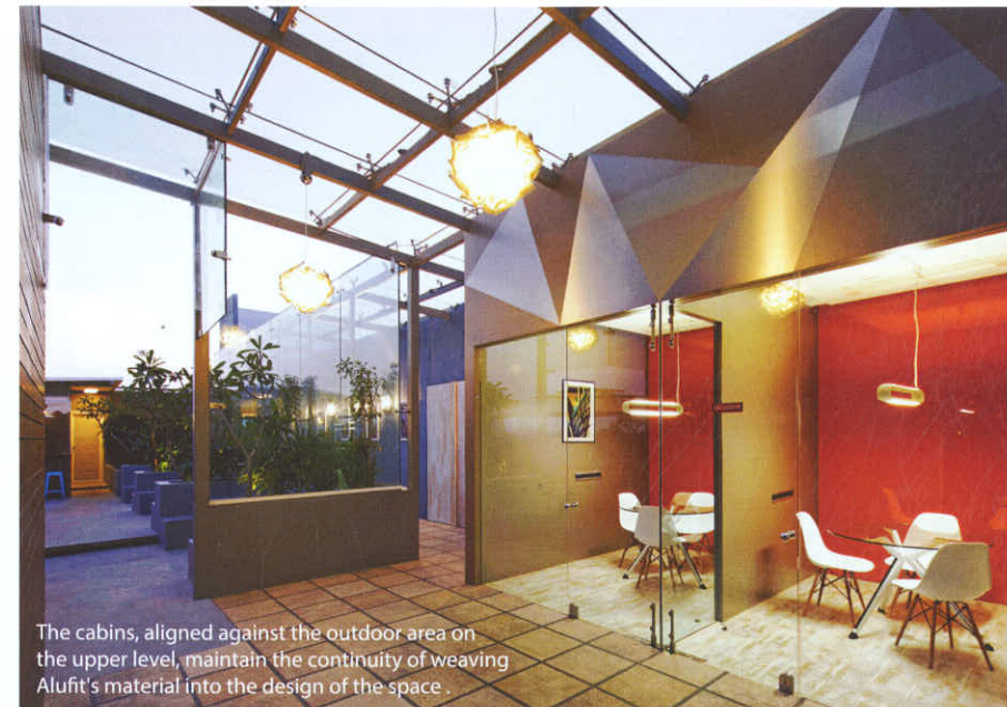
The cabins, aligned against the outdoor area on the upper level, maintain the continuity of weaving Alufit's material into the design of the space.

The presence of Ulsoor Lake in the vicinity is a feature, which is used to its fullest. The designer wanted to make sure that the spectacular view is accessible from any point in the office.