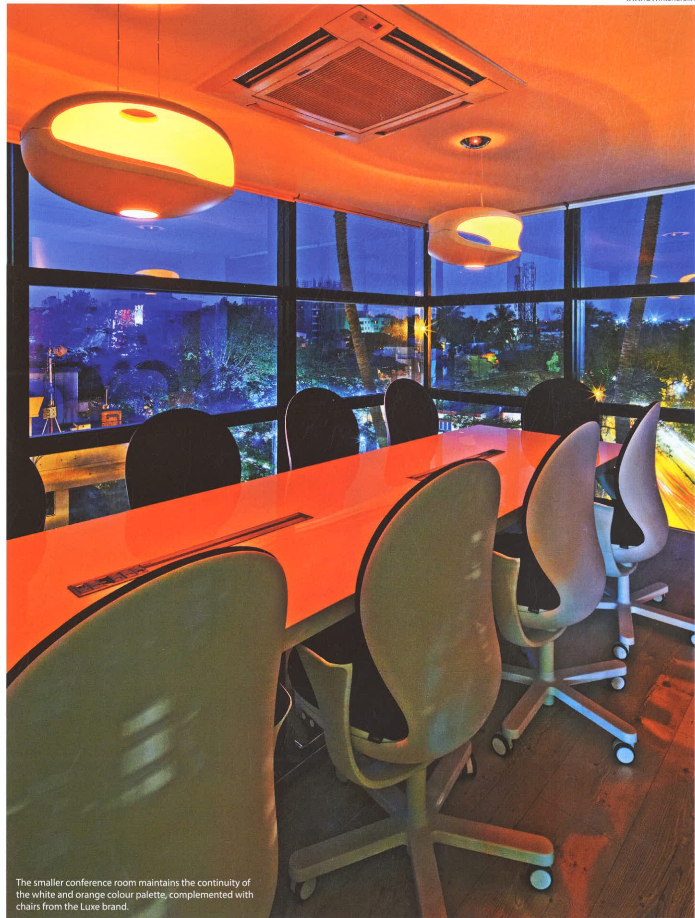
The smaller conference room maintains the continuity of the white and orange colour palette, complemented with chairs from the Luxe brand.