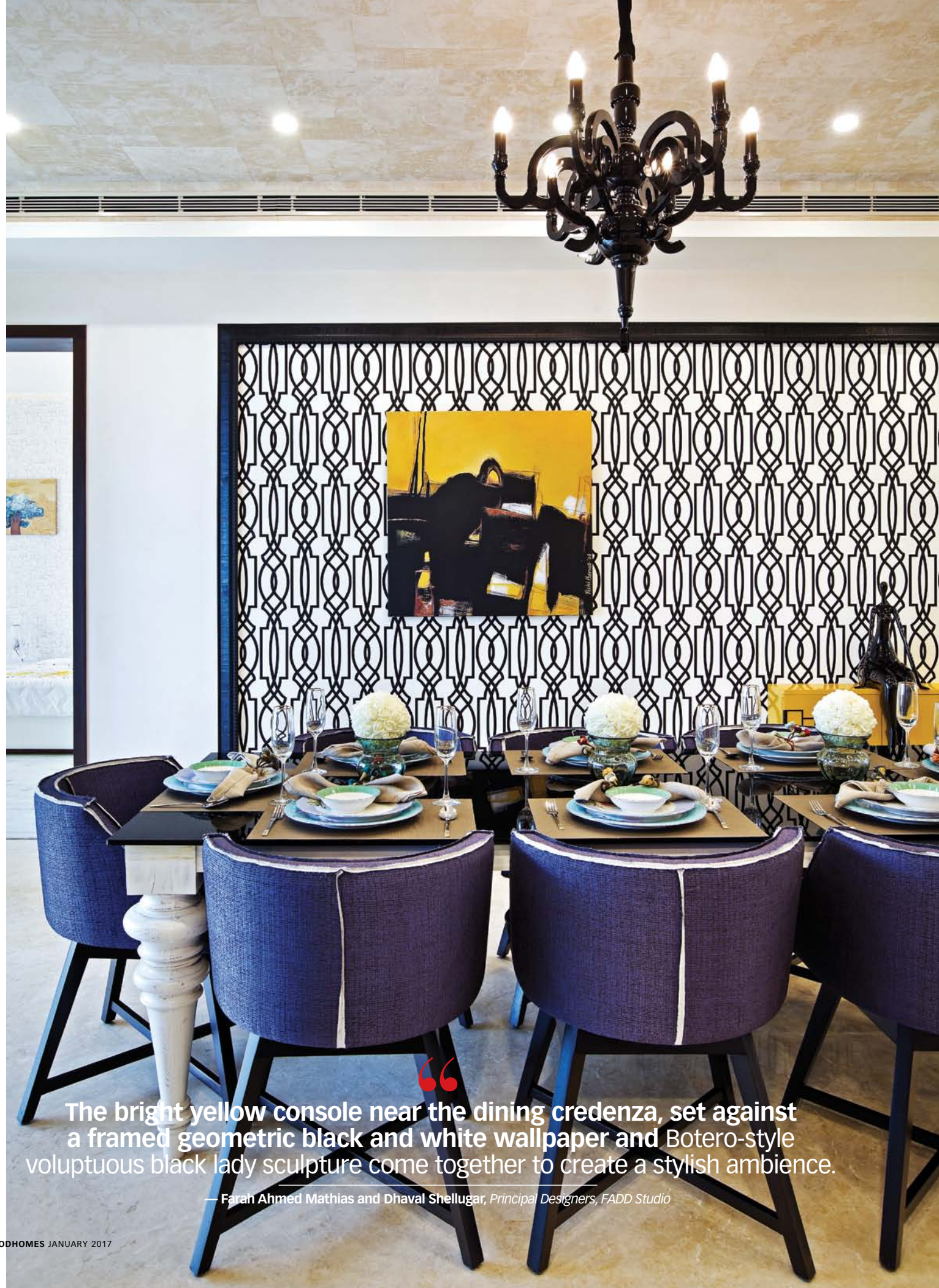
“The bright yellow console near the dining credenza, set against a framed geometric black and white wallpaper and Botero-style voluptuous black lady sculpture come together to create a stylish ambience.