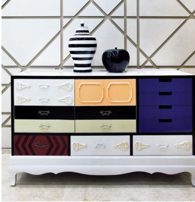
(TOP & LEFT) Sofas from Pinakin and Ligne Roset and rugs from Indelust are set against a geometric textured wall — the interesting combination of Indian and western designers adds to this eclectic mix of colours, textures and patterns. (RIGHT) The custom-made consoles in warm tones work in perfect sync with the rugs. The dramatic splash of colour on the consoles make it an interesting design.