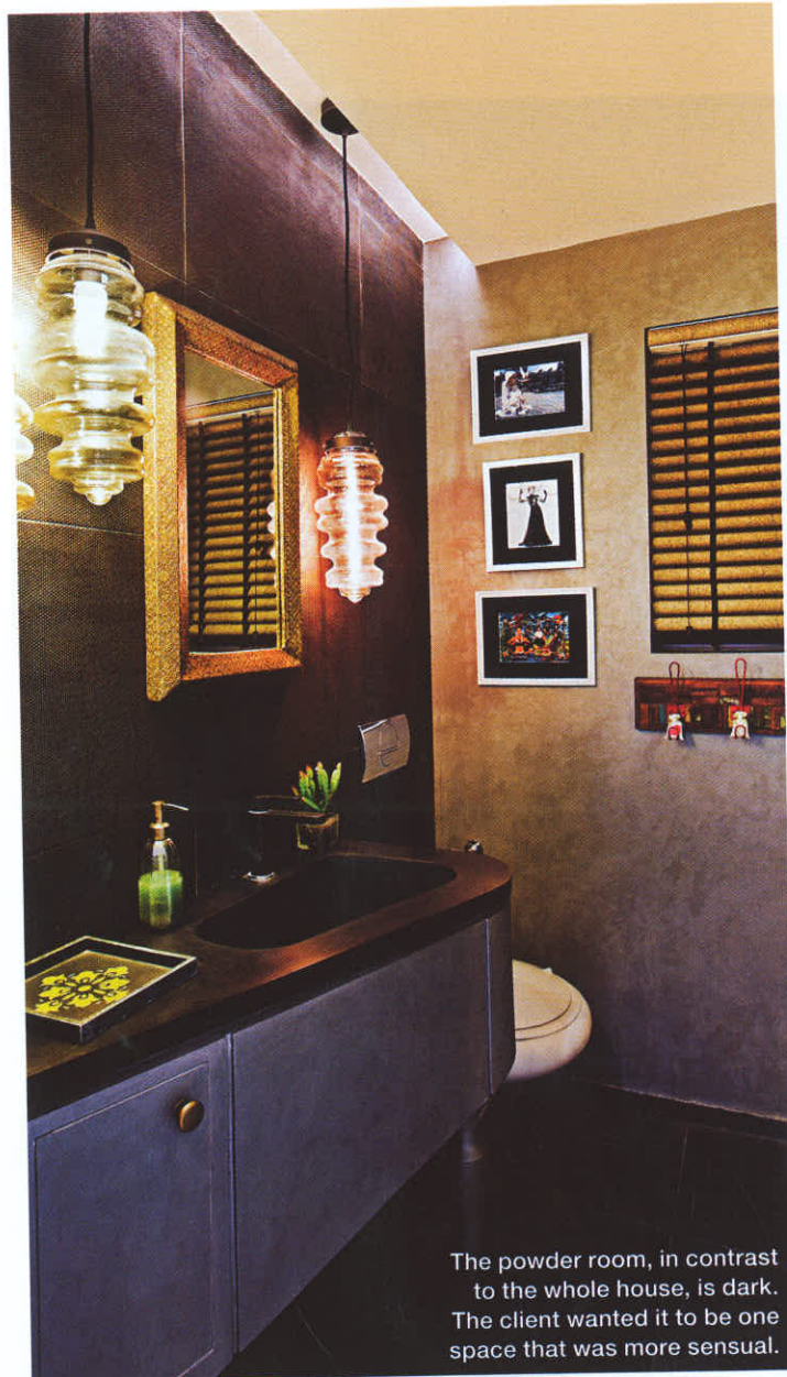
The powder room, in contrast to the whole house, is dark. The client wanted it to be one space that was more sensual.

mirrors on alternate shutters. A bright yellow printed blind enhances the olive wall,' adds Farah. The floor is done in white wooden tiles which are slightly different from the ones used in the living room. The bathroom has lovely distressed tiles in similar colors with the luxurious stone series from Villeroy and Bosh.