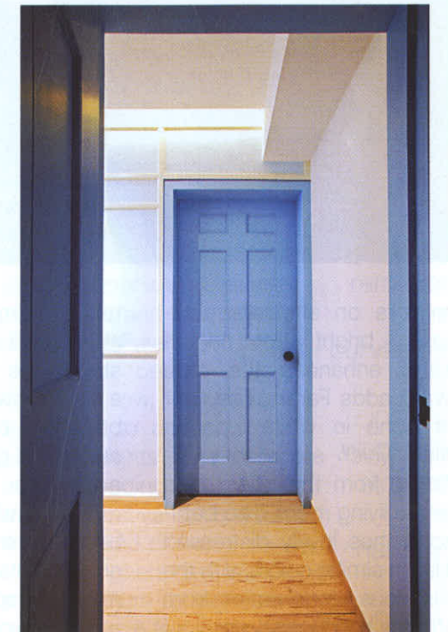
A second, smaller guest bedroom encloses the bed and closets as one unit to maximise space.

In the master bedroom, the designers demolished the curved wall and created more straight-line walls to be more functional. They removed the marble floor and replaced it with 12-ft-long white tiles which look like wooden planks. In all, the space looked much bigger and brighter. 'In the master bedroom which is olive, we have given louvred white closets with