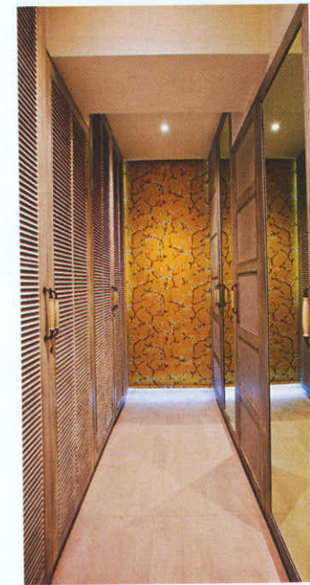
Louved white closets with mirrors on alternate shutters are provided for functionality in the master bedroom.

between the master and the adjoining bedroom and instead went with straight-line hallways and doorways,' says Farah.