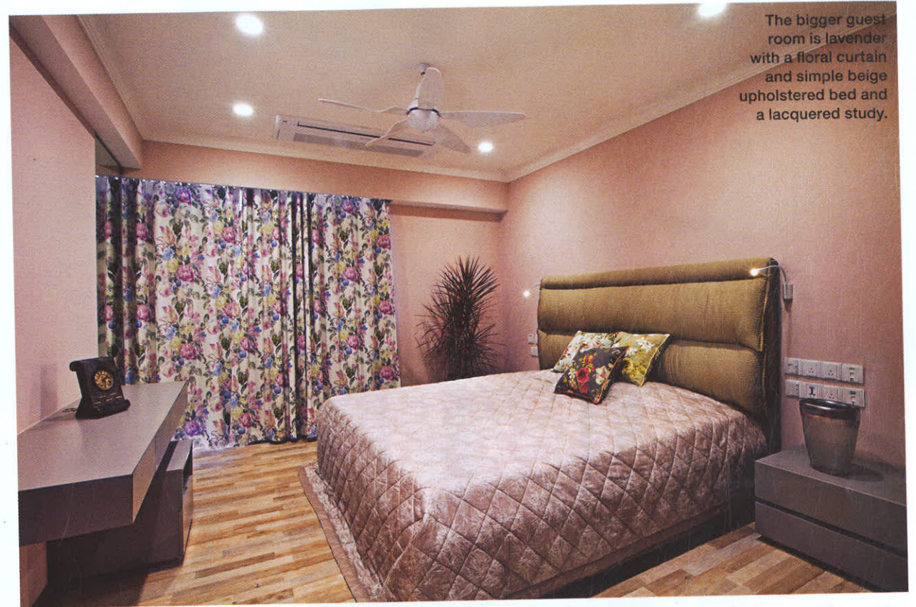
The bigger guest room is lavender with a floral curtain and simple beige upholstered bed and a lacquered study.