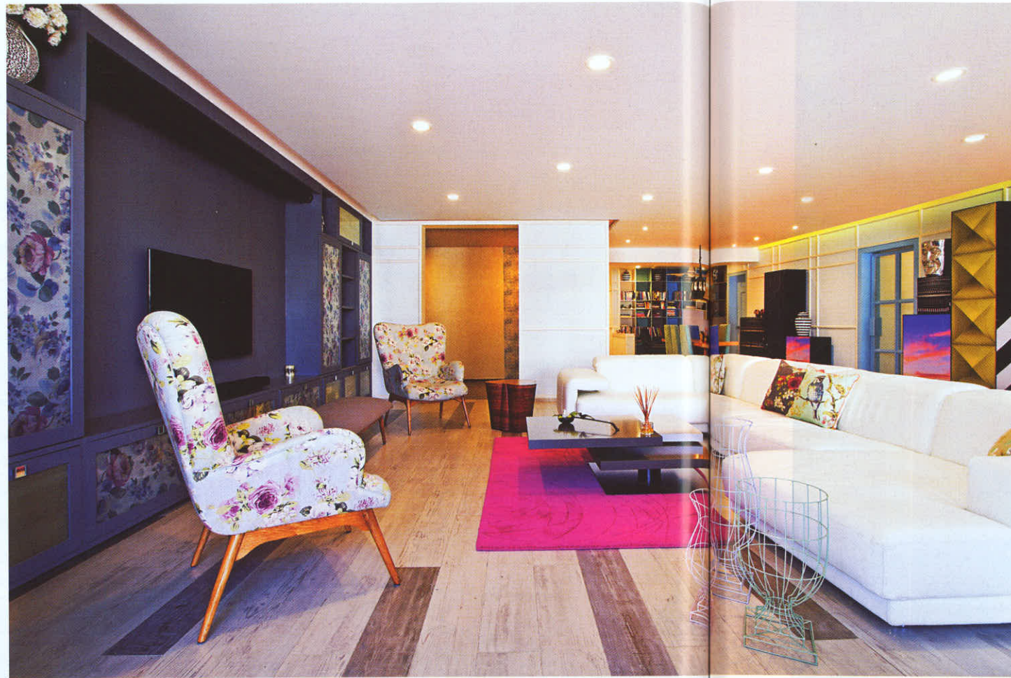
The contemporary living space is dressed primarily in blues, whites and vintage floral prints. The walls adorn a cool azure with white paneling and the room doors are painted in powder blue to impart a soothing, light and fresh feel to the whole space.