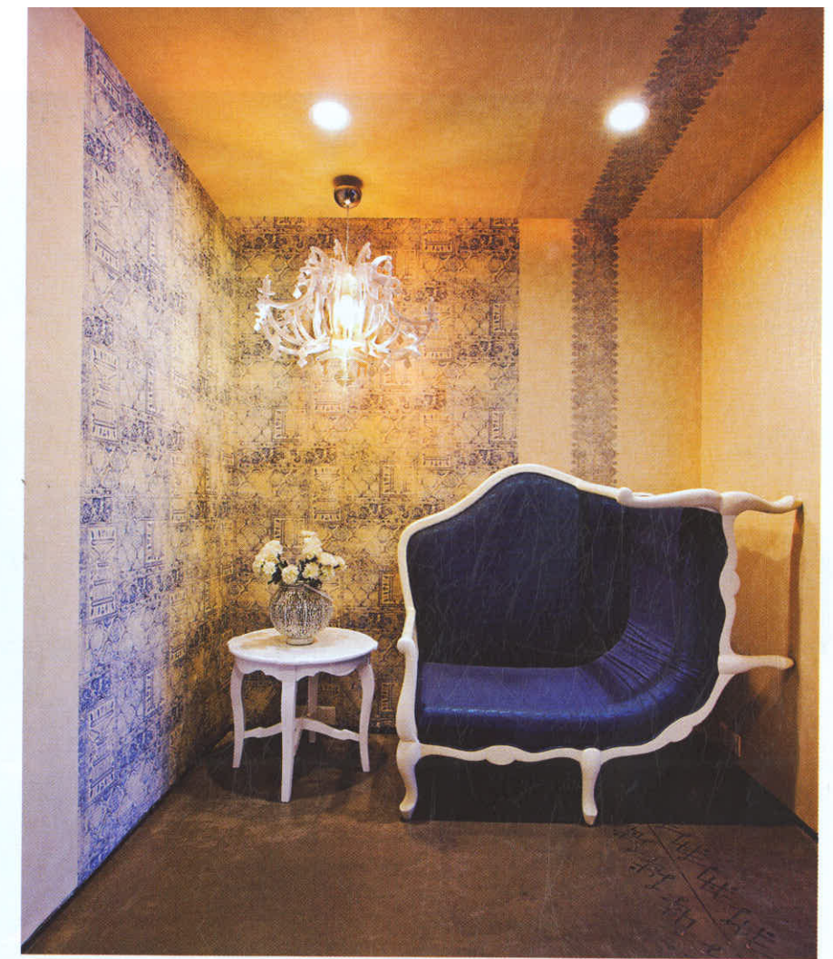
A white crawling sofa with royal blue upholstery stands against a wall clad in a royal blue and beige patterned wallpaper in the foyer leading up to the living and dining room.